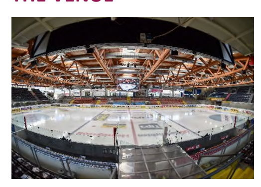
Main Rink: Keine Sorgen Eisarena Untere Donaulände 11 4020 Linz